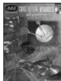
CHART READING WORKBOOK FOR DRUMMERS